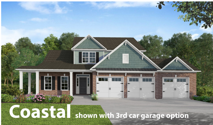
Coastal shown with 3rd car garage option