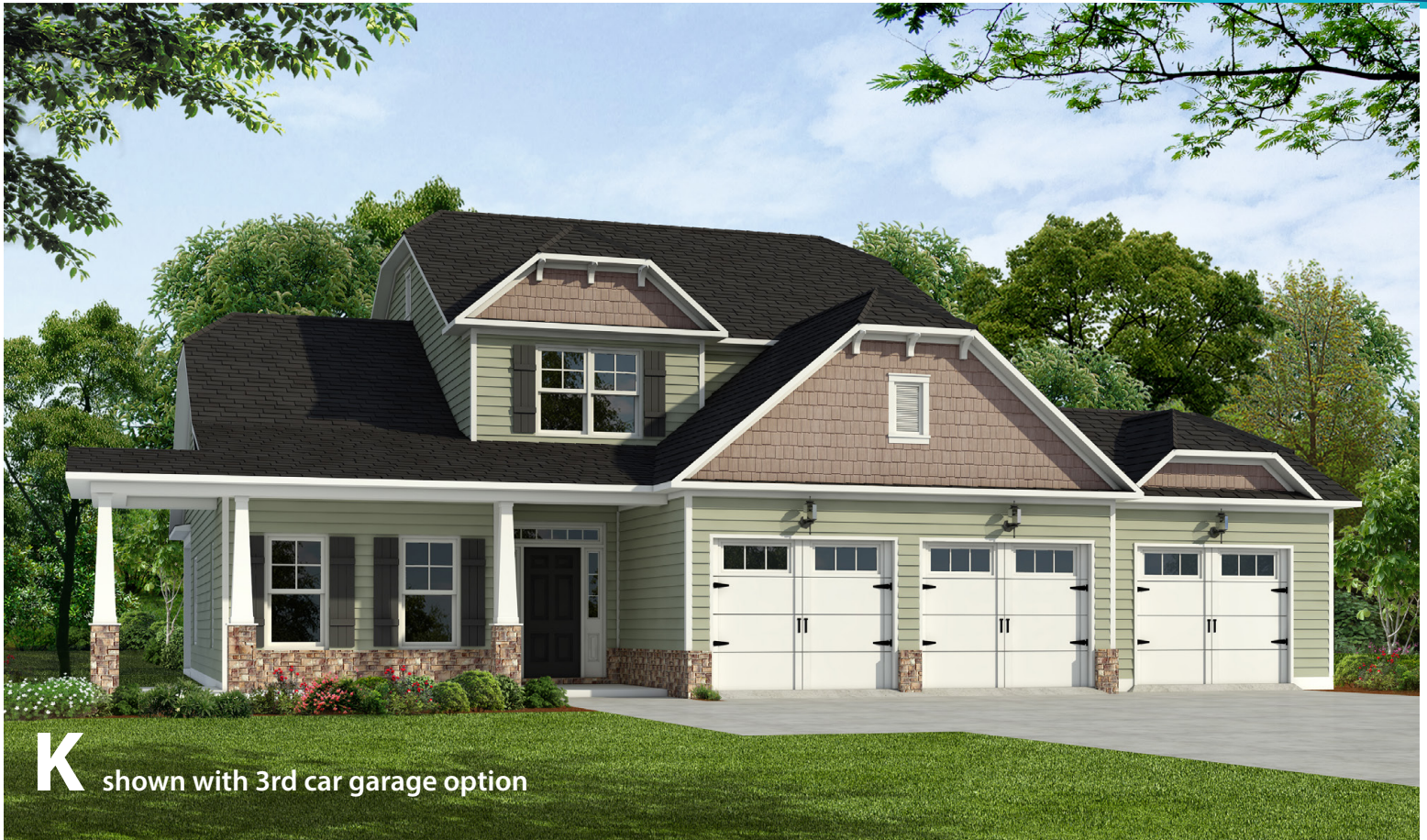
K shown with 3rd car garage option